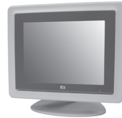
▲ Desktop stand